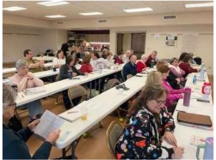
February School of Leaders at Good Shepherd