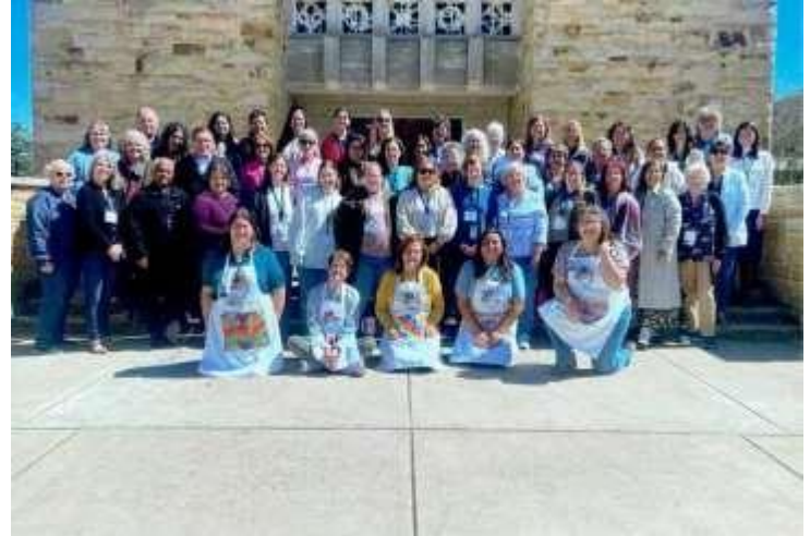
Congratulations to the Candidates and Team for Women's Weekend 148!