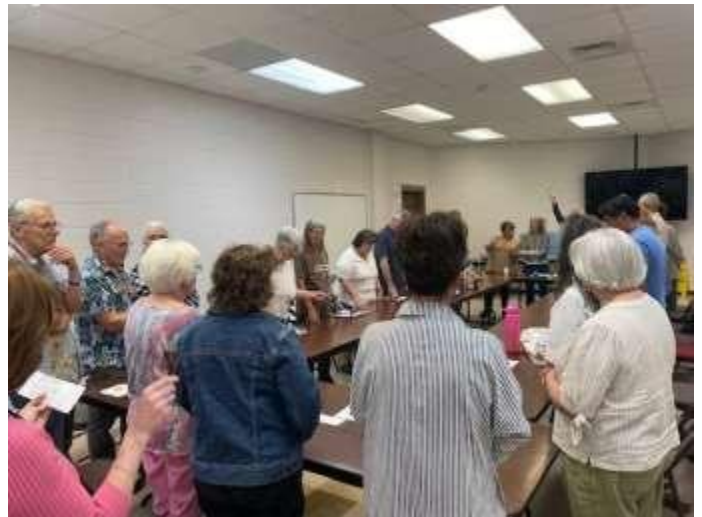
March Ultreya, Madison!