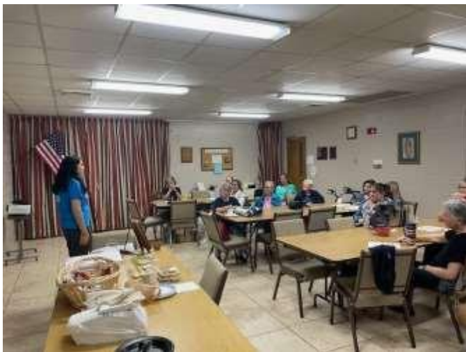
St,Thomas, April Ultreya!