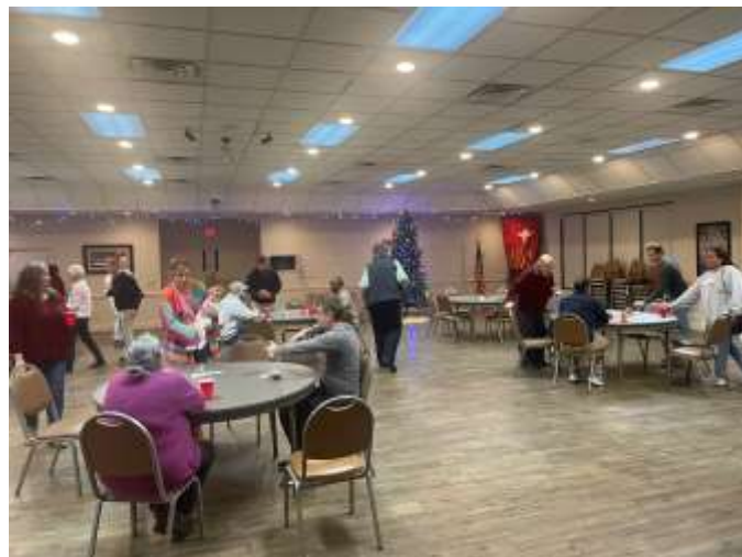
Tuscaloosa January Ultreya